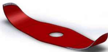
Figure 2 weeder blades [14]