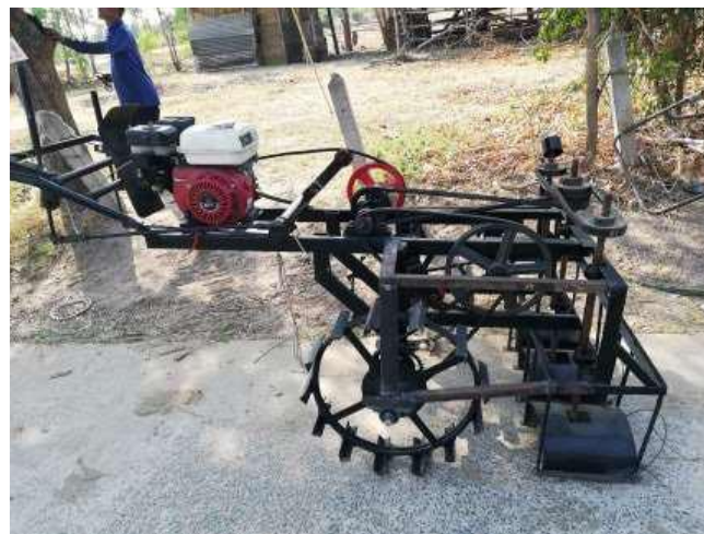
Figure 3 Weeder machine in paddy field 3 rows

Results of the study and development of weed exterminators in rice fields the engine sends power to a 2-inch pulley, then to an 8-inch, 2-inch, and 12-inch pulley, respectively, and to a 15-tooth and 42-tooth gear to drive the wheels. The blade part uses an engine to transmit power from a 2-inch flywheel to a 7-inch, 5-inch, and 4-inch flywheel to make the blade rotate, thus creating a weed-killing machine in rice fields (Figure 3).