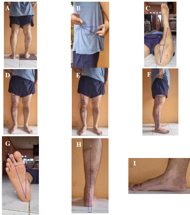
Figure 1 Lower limb alignment measurement methods for: (A) limb length inequality; (B) pelvic angle; (C) femoral antetorsion angle; (D) quadriceps (Q) angle; (E) tibiofemoral angle; (F) genu recurvatum angle; (G) tibial torsion angle; (H) rearfoot angle and (I) medial longitudinal angle

Gross's methodology (Jonson, & Gross, 1997). The rearfoot angle was defined as the angle formed by the line dividing the calcaneus and the line dividing the lower one-third of the leg (Figure 1H). The measurement of the medial longitudinal arch angle involved determining the angle formed by a line from the medial malleolus to the navicular tuberosity, and another line connecting the navicular tuberosity to the medial side of the first metatarsal head (Figure 1I). Abnormal foot alignment was detected when the rearfoot angle exceeded 9^\circ and the medial longitudinal arch angle fell below 134^\circ (Jonson, & Gross, 1997).