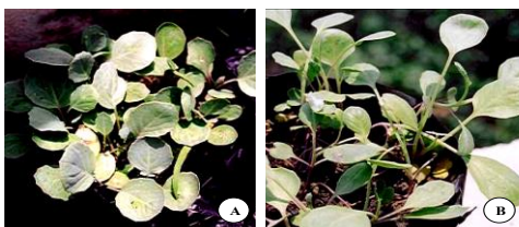
Figure 4 Brassica alboglaba , control (A), sprayed with spore suspension at 10^6 spores/ml of Drechslera holmii (B)

A pathogenicity test of fungi isolated from weed was conducted using Drechslera holmii . It was inoculated in the greenhouse to four healthy plant species; Cyperus brevifolius , Brachiaria mutica , Dactyloctenium aegyptium and vegetable Brassica alboglaba . Spore suspension at 10^6 spores/ml of D. holmii was sprayed on artificial wounded leaves of the 4 week-old healthy seedlings. It caused severe damage only on D. aegyptium . Disease symptoms were found after 5 days of inoculation. This fungus in USA was also reported to cause leaf spot disease of D. aegyptium but there were no further tests on any crops (Ellis, 1971). Therefore, the potential use of D. holmii as a biological control on vegetable plots is worth further investigating.