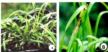
Figure 3 Dactyloctenium aegyptium , control (A); Sprayed with spore suspension at 10^6 spores/ml of Drechslera holmii (B)

For this study, we obtained 25 fungal isolates, but there was only one isolate, Drechslera holmii , which caused weed disease. Therefore, D. holmii was investigated for potential use as a biological weed control agent in the vegetable fields.