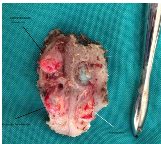
Figure 2 Photograph showing harvested specimen, which indicates successful vertical onlay augmentation with the use of the mesenchymal stem cells.